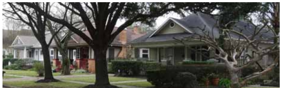
One-story buildings align within this Houston Heights context.

In recent years, the neighborhood has been revitalized. Modern buildings are being built on vacant lots, using traditional details in order to blend in with the rest of the neighborhood. The Houston Heights Association was organized in 1973 to promote revitalization. That organization currently has about 1,000 members and manages new deed restrictions adopted in various sections of the neighborhood.