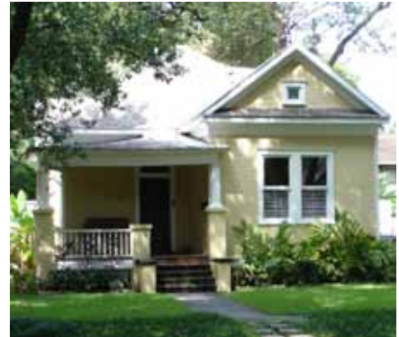
Contributing buildings in Houston Heights Historic District East