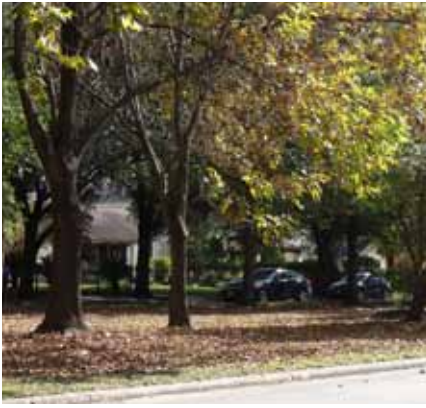
A mature tree canopy is present throughout the Houston Heights Historic Districts.