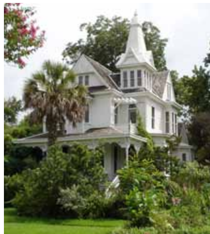
Mansfield House (Pattern-Book)