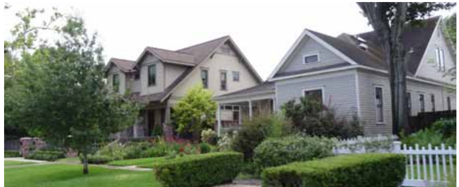
This context area in Houston Heights contains buildings of various heights.

Houston Heights was designated as a Multiple Resource Area (MRA) in 1983 by the National Park Service. An MRA designation is used when an area contains multiple potential landmarks and historic districts which are not all contiguous. Houston Heights qualified for an MRA designation because it had been (between 1896–1918) an independent municipality of fewer than 50,000 inhabitants, it retained its own character and diversity when it was annexed by Houston, and it already contained many buildings which were individually listed in the National Register of Historic Places. During the MRA designation process, both the National Park Service and the Texas Historical Commission recommended establishing multiple historic districts within the original boundaries of Houston Heights. The three Houston Heights Historic Districts were created to recognize distinct areas within the former city and to identify the diversity of development found there.