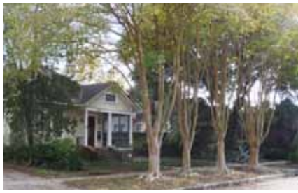
One-story buildings are common to the Houston Heights historic districts.