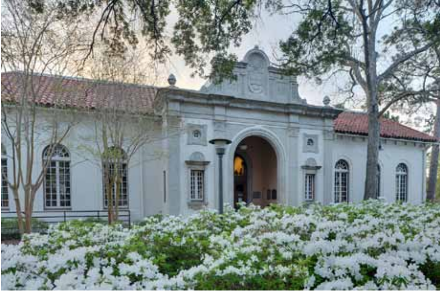
Heights Public Library

The Houston Heights Historic Districts contain a small number of historic commercial buildings, as well as churches, schools, a fire station, the former Masonic Lodge, and the Heights Library. Most of these buildings are constructed with brick or stone masonry. They vary widely in style, design, and construction.