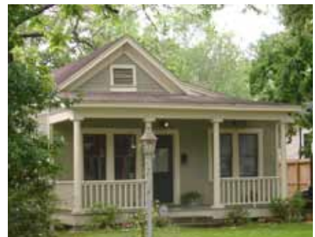
Contributing buildings in Houston Heights Historic District West