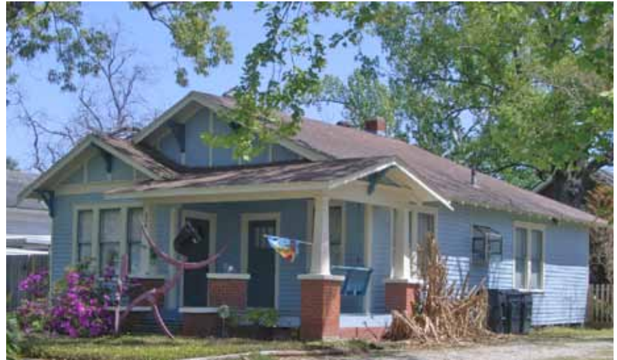
Craftsman bungalows in the Heights