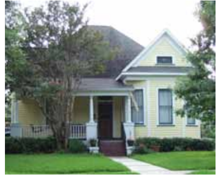
Contributing buildings in Houston Heights Historic District South