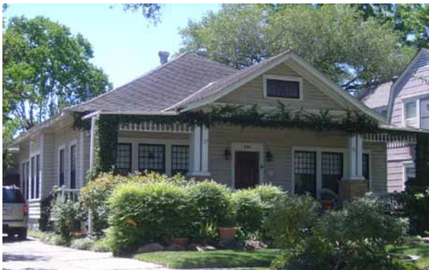
An example of transitional architecture

During the early 20th century, builders often combined the Queen Anne style, which was beginning to go out of fashion, with the newly popular Craftsman style. This was not uncommon, and the practice continued through the 20th century. As a result, it is not unusual to see buildings that historically combined details from different architectural styles.