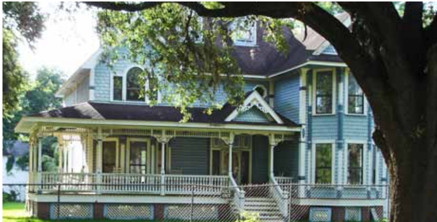
Queen Anne houses in the Heights