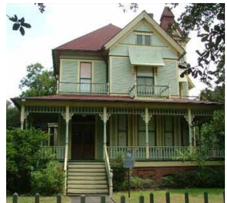
Milroy House (Pattern-Book)